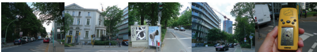
Figure 10. 5008 Frankfurt/Main

for discussion about their 5107-experiences, as well as for other topics like faced, solved or unsolved problems of Dortmund’s urban space 8 .