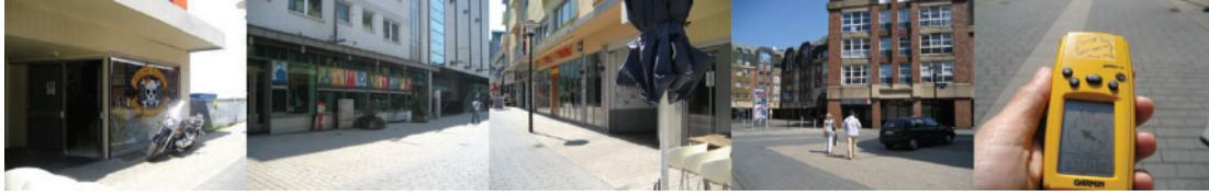
Figure 7. 5107 Dortmund