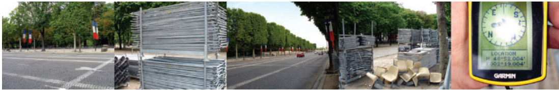
Figure 4. 4802 Paris