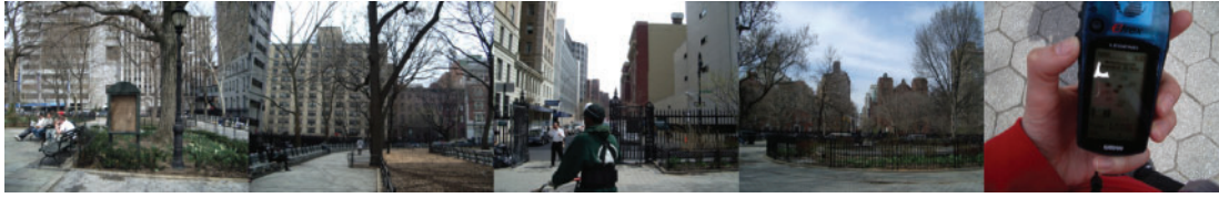
Figure 3. 4074 Manhattan