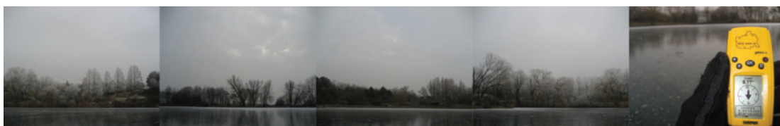
Figure 2. 4816 Vienna (photos: Evamaria Trischak)

Within the city proper of Paris (N48°E02°) about two million people live in an area of around 100 km 2 (United