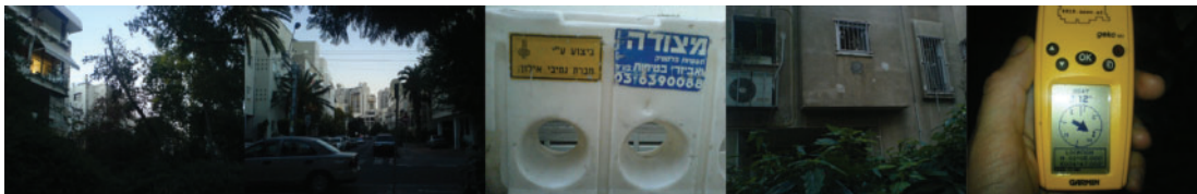
Figure 5. 3234 Tel Aviv