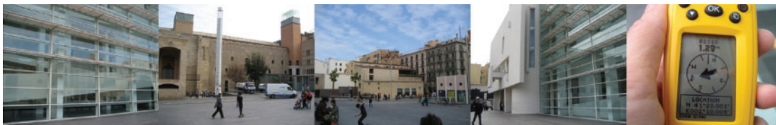
Figure 6. 4102 Barcelona

Nations, 2008), which contains about 50 intercept points 5 . The NSEW approach is without regard to the conventional arrangement of the Parisian urban space, i.e. the streets and arrondissements. Obvious points of interest like Sacre Coeur, Notre Dame, Eiffel Tower, Louvre and Centre Pompidou get left out in favour of ordinary, but not less fascinating corners of the city, which was the hometown of the prime meridian until 1884.