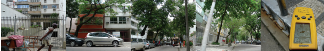
Figure 8. 2243 Rio de Janeiro